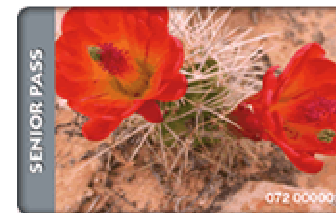
Interagency Senior Pass $10.00