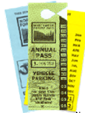
Northwest Forest Pass $30.00