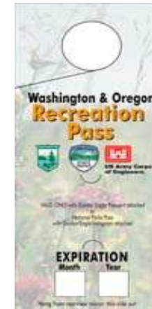
Washington and Oregon Recreation Pass $20.00 (Must have an #80.00 Annual Pass)